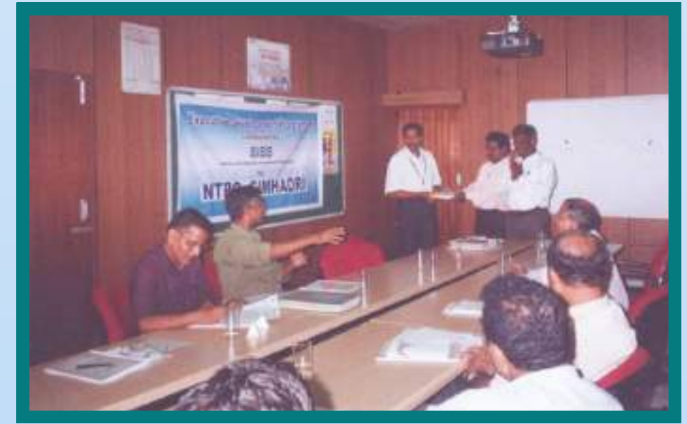
3 Day Workshop on General Management for NTPC Simhadri