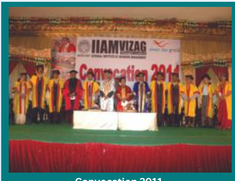
Convocation 2011 Chief Guest : Mrs. D. Purandeswari Former Minister of Education, Govt. of India